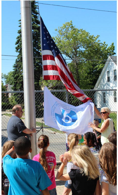
IB flag raising at RUSD

At the heart of all our programmes is the IB Learner Profile, a long-term, holistic vision of education that underpins the IB continuum of education and puts the student at the center of everything we do. The Learner Profile is the IB mission statement in action and provides a set of learning behaviors which aims to inspire, motivate and focus students, teachers and the entire IB School community, uniting them in a common purpose.